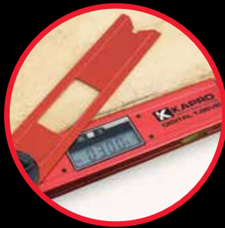
180° readout - readable, when level is inverted