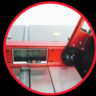
Adjustable blade locks at any angle