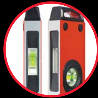
Plumb Site® Dual-View™ vials