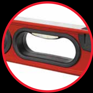
Ergonomic "Air-cushioned" handle