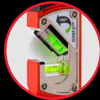
Swivel Plumb Site ®