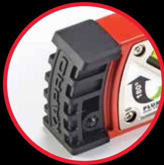
Oversized Shock-proof rubber end caps with anti-slip feature