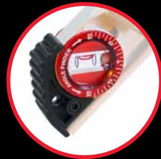
Gradient markings angle transfer vial