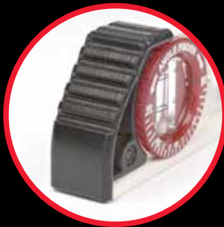
Advanced impact rubber resistance end caps