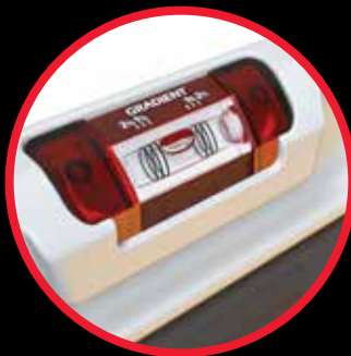
OPTIVISION ® Red tilted horizontal vial