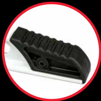
Shock absorbing rubber strike cap