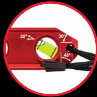
Unique 30° and 45° bevel offset edge