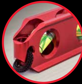
V-Groove base for pipe and conduit leveling