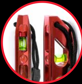
vertical Plumb Site ® Dual-View™ vial