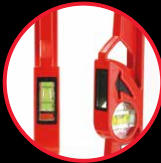
Plumb Site ® Dual-View ™ vial