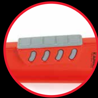
Shock-absorbing rubber anvils