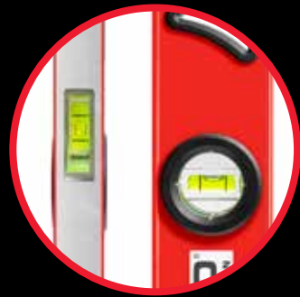
Plumb Site® Dual-View™ vials