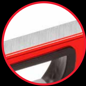
2 finely milled surfaces