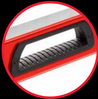
Magnified Ergo Grip™ non-slip handle