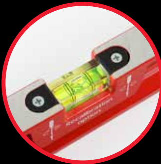
Adjustable horizontal vial with gradient lines up to 2%