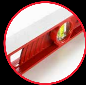
2 milled surfaces