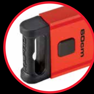
Shock-absorbing rubber end caps