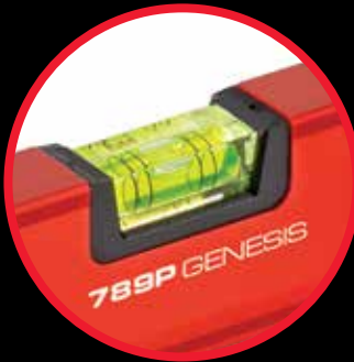
Solid acrylic epoxy locked vial