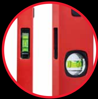
Plumb Site ® Dual-View ™ vial