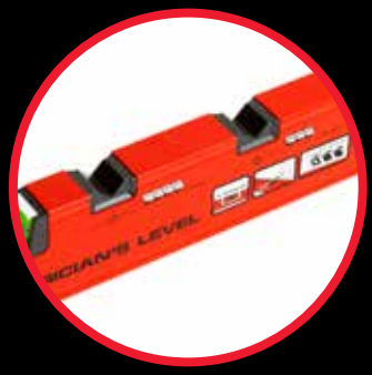
Markers at 71 mm intervals