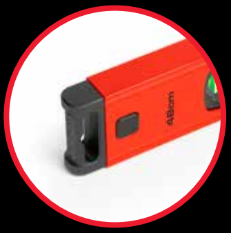
Shock-absorbing end caps