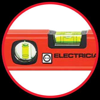
Horizontal & Vertical vials