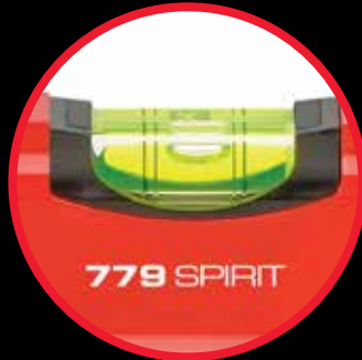
Solid shockproof acrylic vial