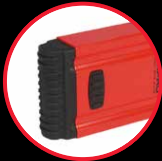
Wall grip feature