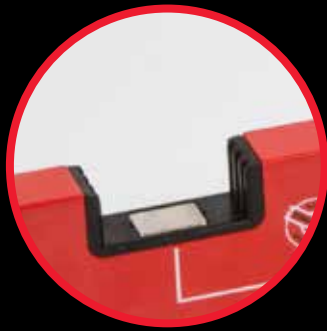
Three 40 mm stud slots