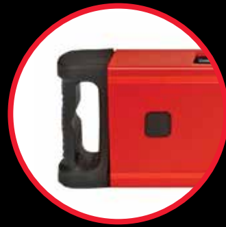
Shock-absorbing end caps