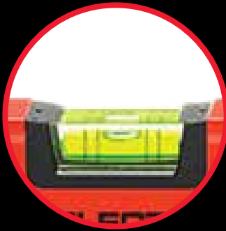
Solid acrylic shockproof vial