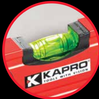
Magnified horizontal vial