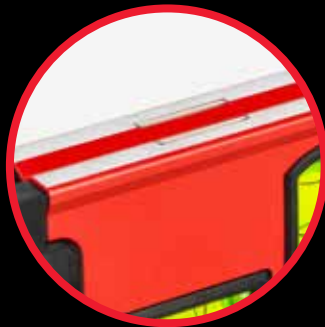
Magnetic V-Groove base for pipe and conduit leveling