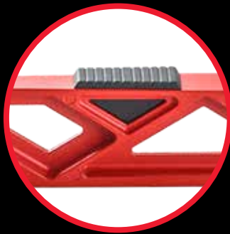
Shock-absorbing rubber anvils