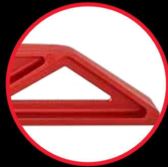
Heavy duty cast Aluminum body