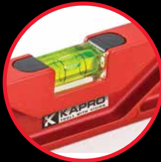
Horizontal vial with gradient lines up to 2%