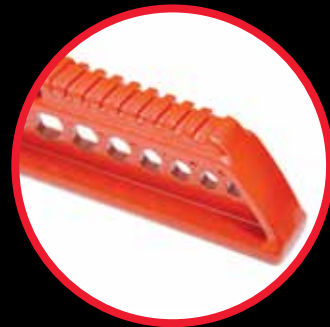
Heavy-duty cast aluminum anvil strike pads