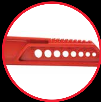
Drill bit diameter gauge