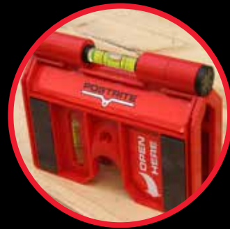
4 powerful magnets for metal surfaces