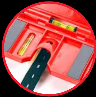
Adjustable elastic strap for non-magnetic surfaces