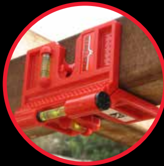
Suitable for all posts, pipes and signs