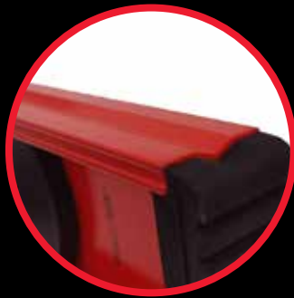
V-Groove base for pipe and conduit leveling