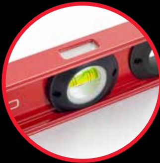
Horizontal vial with window for top-down view