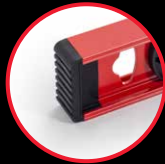
Shock-absorbing rubber end caps