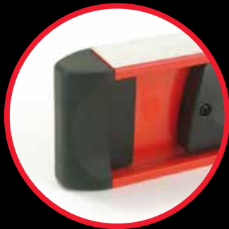
Shock-absorbing rubber end caps