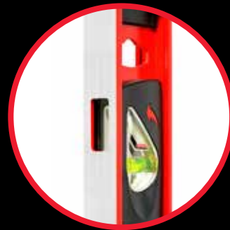
Plumb Site ® Dual-View ™