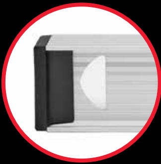
Tough ABS end cap