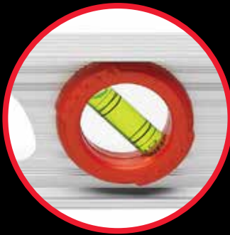
Cylindrical 45° Vial