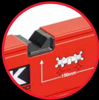
150 mm for tap placement