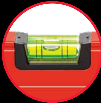
Horizontal solid acrylic vial with gradient lines up to 2%