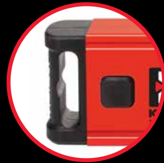
Wall-grip keeps the level in place