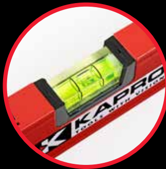
Solid acrylic shockproof vials