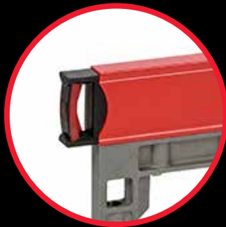
Shock-absorbing rubber end caps