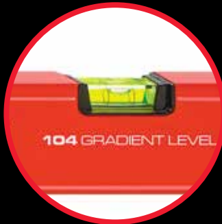
Solid acrylic shockproof vial