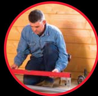
Sets measuring slopes up to 10%