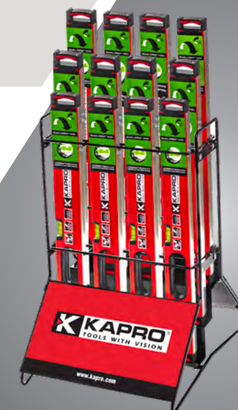
12 Piece metal display